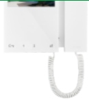
6701W SIMPLEBUS2 MINI DOOR ENTRY MONITOR WITH HANDSET

Wall-mounted colour monitor with 4.3" 16:9 screen and handset. Allows brightness and contrast control, plus adjustment of the volume of the ringtone, which can be customised with a choice of different melodies. Equipped as standard with 4 soft touch buttons for door-opening, self activation, switchboard call, silent mode and with door status indicator LEDs. Manages floor door calls as standard. Option of adding 4 additional buttons with accessory art. 6733W. Complete with 2 x 8-position DIP-switches for user code programming and button programming. Includes wall-mounting or residential series box backplate and riser distribution terminal art. 1214/2C. The monitor can only be used in 2-wire Simplebus2 systems. Dimensions: 175x160x22mm.